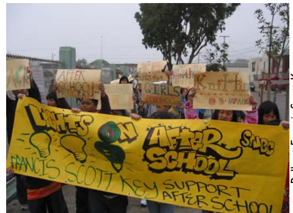
Rally at Francis Scott Key

In class we work hard and let our light shine Our future looks bright as we strengthen our minds If you want success then listen to me Be the light of the world with knowledge you're free.