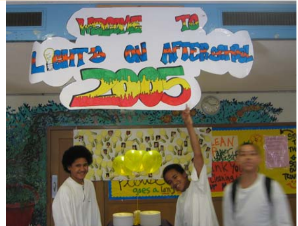
Students at Luther Burbank