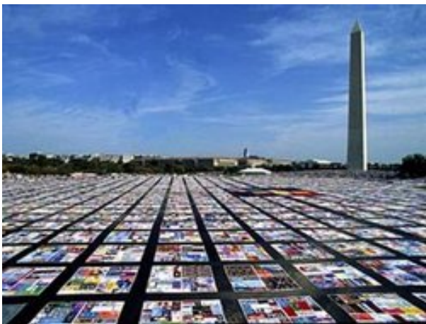
Picture of the AIDS Quilt from Wikipedia.com

If you are interested in bringing the AIDS Quilt to your after school program, contact the Health Advocate/Health Liaison at your school site and review the October 26th WAD.