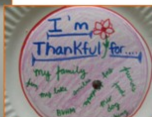
Students and mentors at Buena Vista Horace Mann expressed their appreciation in a Plate of Thanks wall hanging