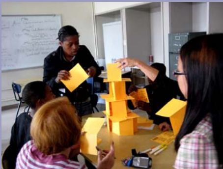
Building a paper tower can be serious business! Communication and innovation are key.

Veteran and new schools involved in Mentoring For Success have successfully launched annual kick-off events during the past few months. These events provide the chance for mentors and students to meet, talk, share a snack, and participate in community building activities together. Specific activities range by school but they are all designed to build trust, communication skills, and provide a safe space to get to know one another a little better.