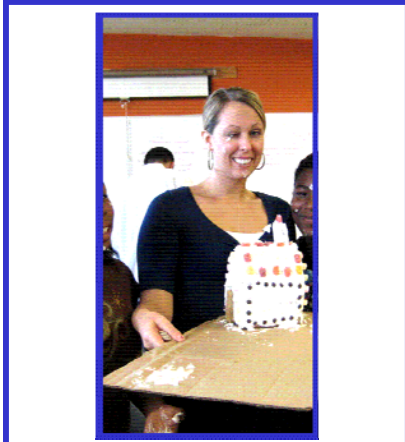
Making a ginger bread house at a recent mentoring event

Now that you have known each other for some time, how do you feel about mentoring?