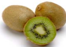
New fact here and picture—studies show